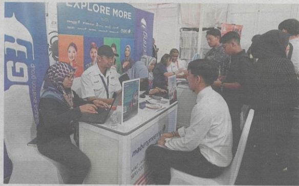
Aviation aspirations: Visitors enquiring at booths during the Career in Aviation Fair at the Skypark Regional Aviation Centre.

Azman said the Statistics Department recently announced that the national unemployment rate continued to decline in the second quarter of 2024, in line with increased demand for labour in the economic sector.