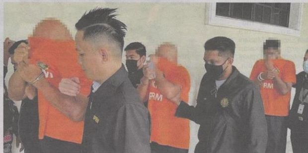
Dua pegawai perubatan hospital kerajaan dan seorang doktor pakar hospital swasta ditahan kes tipu tuntutan PERKESO.

Pada 3 September, Suruhanjaya Pencegahan Rasuah Malaysia (SPRM) me-